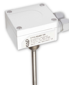
Immersion temperature sensor ETF2 RS485