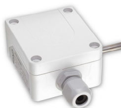
Outside temperature sensor ATF2 RS485 with only 1 PG