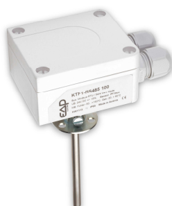
Duct temperature sensor KTF1 RS485