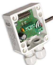
Outside temperature sensor ATF2 RS485