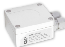
Surface contacting temperature sensor ALTF2 RS485