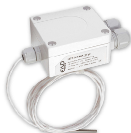
Sleeve temperature sensor HTF RS485 Teflon 2m